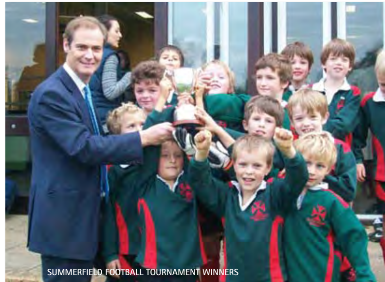
SUMMERFIELD FOOTBALL TOURNAMENT WINNERS

Enthusiastic and energetic boys settled quickly into the new academic year and have been making the most of the exciting activities and stimulating curriculum. After a very short time, new Kindergarten boys felt at home and Form 3 boys, in particular, should be praised for being such good role models and for undertaking their new responsibilities in such a conscientious manner.