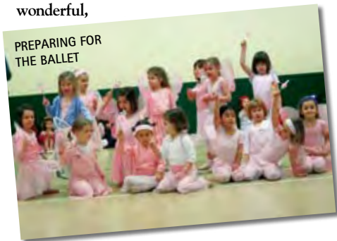
PREPARING FOR THE BALLET