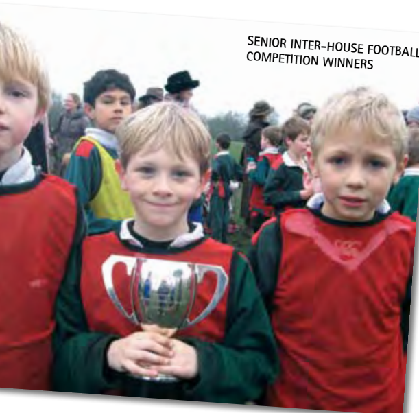
SENIOR INTER-HOUSE FOOTBALL COMPETITION WINNERS