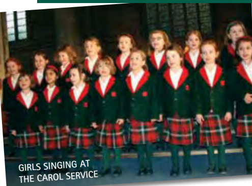
GIRLS SINGING AT THE CAROL SERVICE