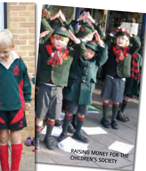
RAISING MONEY FOR THE CHILDREN'S SOCIETY

Pre-Prep, but also other parts of the school. Carol singing and the Christingle Service at Westminster Abbey have been highlights, as well as performing on Open Day. The Pre-Prep Carol Service was, as usual, a magnificent event that got everyone in the festive spirit.