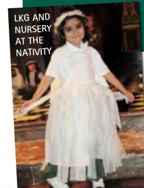
LKG AND NURSERY AT THE NATIVITY