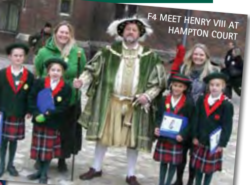
F4 MEET HENRY VIII AT HAMPTON COURT

September 2010 saw the arrival of 34 new girls, four new teachers and one new Headmistress! This wonderful group of teachers and girls wasted no time settling in and the school continues to grow and thrive.