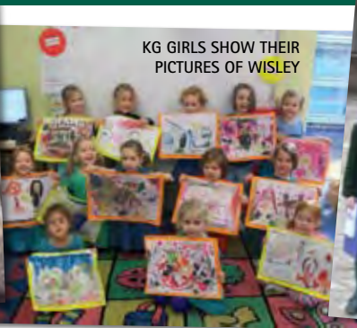
KG GIRLS SHOW THEIR PICTURES OF WISLEY