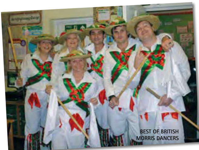
BEST OF BRITISH MORRIS DANCERS