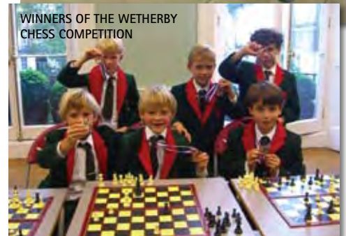
WINNERS OF THE WETHERBY CHESS COMPETITION