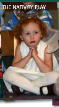
THE NATIVITY PLAY