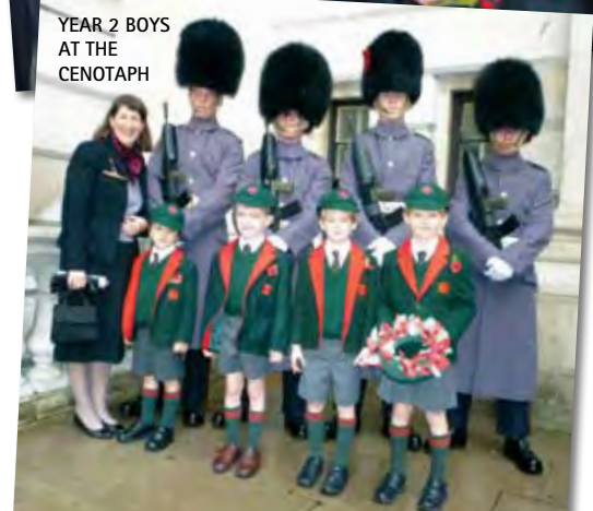
YEAR 2 BOYS AT THE CENOTAPH