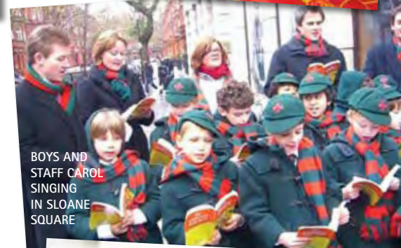
BOYS AND STAFF CAROL SINGING IN SLOANE SQUARE