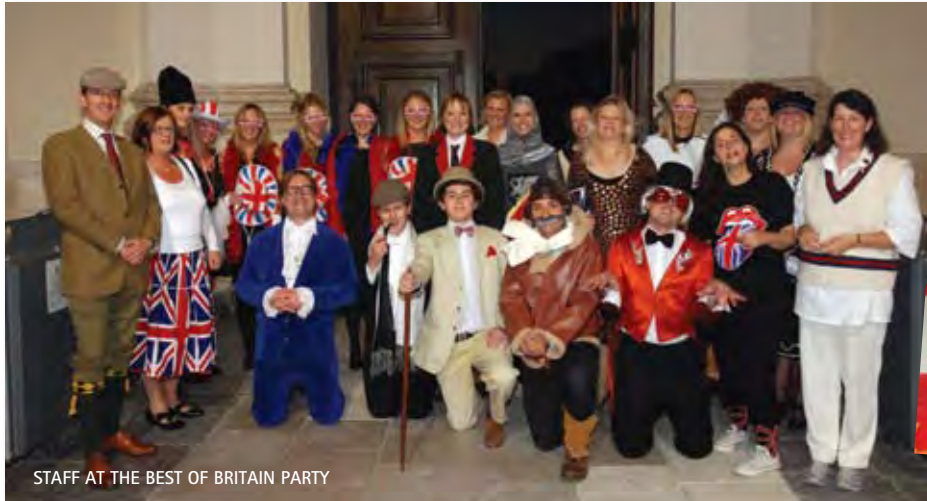
STAFF AT THE BEST OF BRITAIN PARTY

Life at Eaton House Belgravia continues to be busy. I never cease to be impressed by the boys' and staff's enthusiasm, energy and talent. In the last year, we have played over 50 matches, covering eight different sports and six after-school and weekend sports clubs. Music also continues to be strong. Two thirds of our boys play an instrument, and last term we had one pupil learning the electric guitar. The Senior Choir performed in public six times last term and were invited to sing at the Elizabeth Street Christmas Fair for the first time and also at The Marsden's 'Celebrate a Life' ceremony, the latter being particularly special and moving.