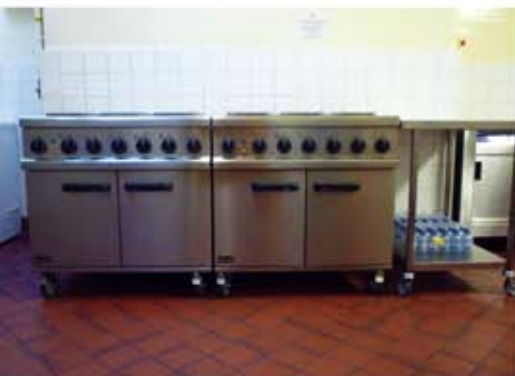
▲ Kitchens – The old ovens have been replaced with state of the art electric ovens