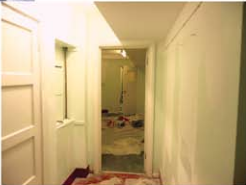
◀ Year 4 Cloakrooms – Following the re-wiring last summer we have now boxed in the pipe work in the cloakrooms, redecorated and replaced the flooring.