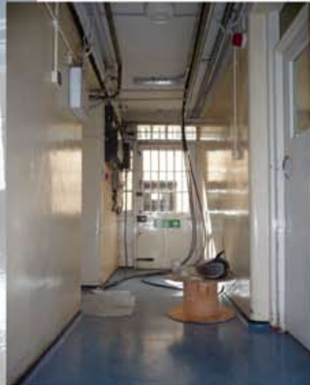
▲ Rewiring – As part of our on-going maintenance and development of the school, we have completely re-wired the buildings and also upgraded the incoming mains supply to allow for future additions to our electronic equipment.