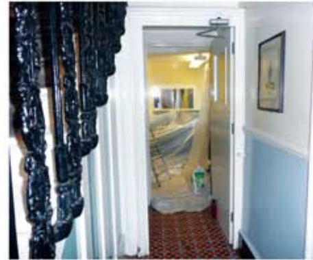
▲ All bathrooms – We have redecorated every loo throughout the buildings, a complicated operation when you can't actually empty the rooms!