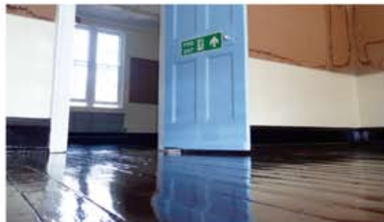
◀▲ 4 classrooms – This summer we redecorated a large number of classrooms, equipped them with new furniture and polished our lovely timber floors to a mirror shine.