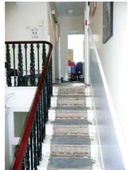
▲▼ Office floor – We emptied the entire office floor, redecorated it completely and then replaced the old carpets.