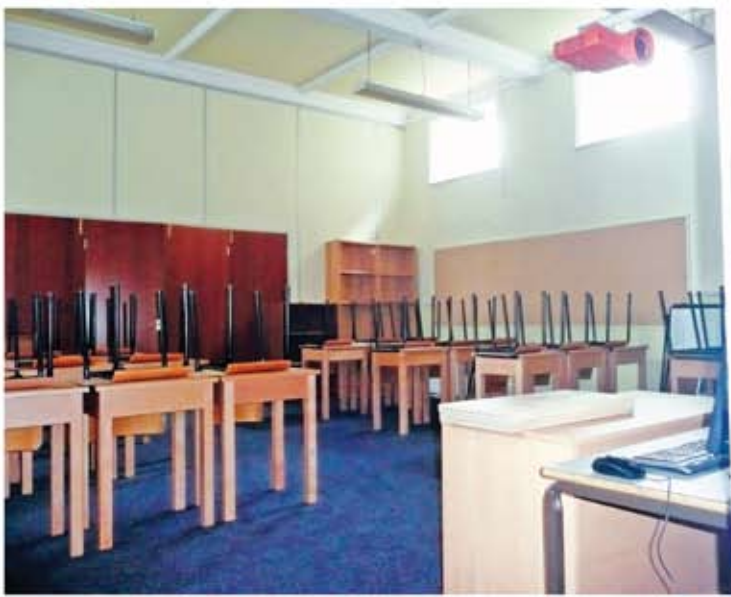
▲ Year 4 – We packed the classrooms and stripped back the old flooring. To our surprise it revealed a gorgeous parquet floor, but as there wasn't enough time to repair this, it has been carefully protected and covered, with the intention to repair and reinstate this later.