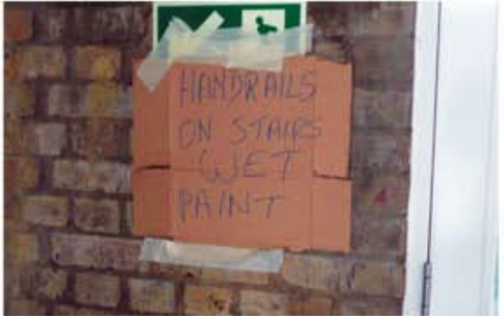
Alongside all the other works we have continued our normal maintenance works throughout the whole site.