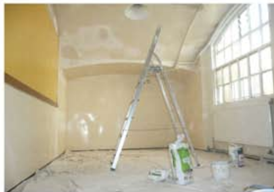
▲ Dining Room – The boys' dining rooms have been brightened up with a fresh coat of paint.